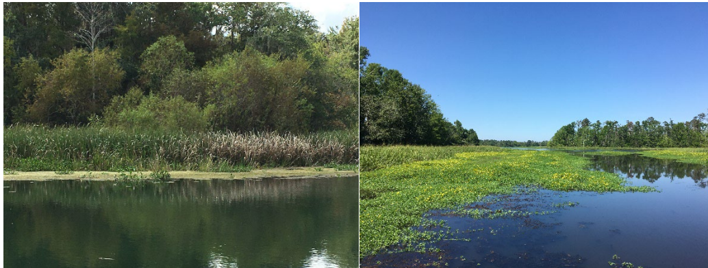
Figure 2: Aquatic Weeds on Lake Seminole FL/GA

species may be targeted in the future should they develop to nuisance levels. The total combined surface acreage of the lake is 37,500 Acres. As much as 60% of the lake has been impacted with aquatic vegetation growth.